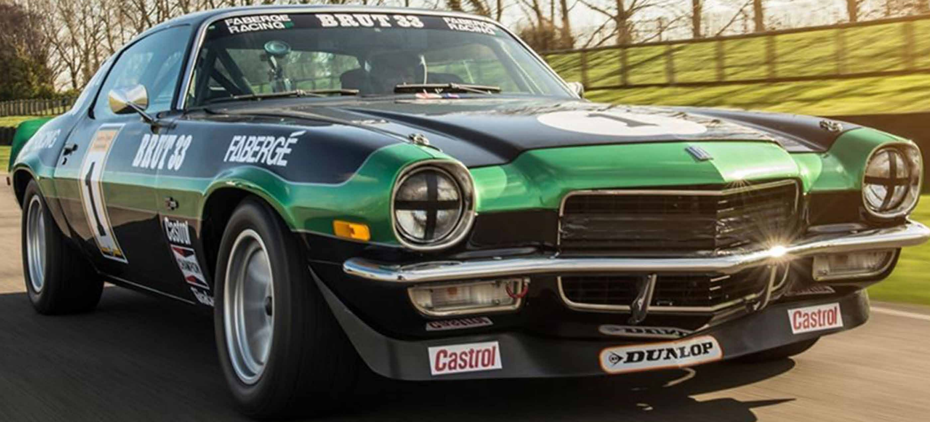
BRUT FABERGÉ CAMARO