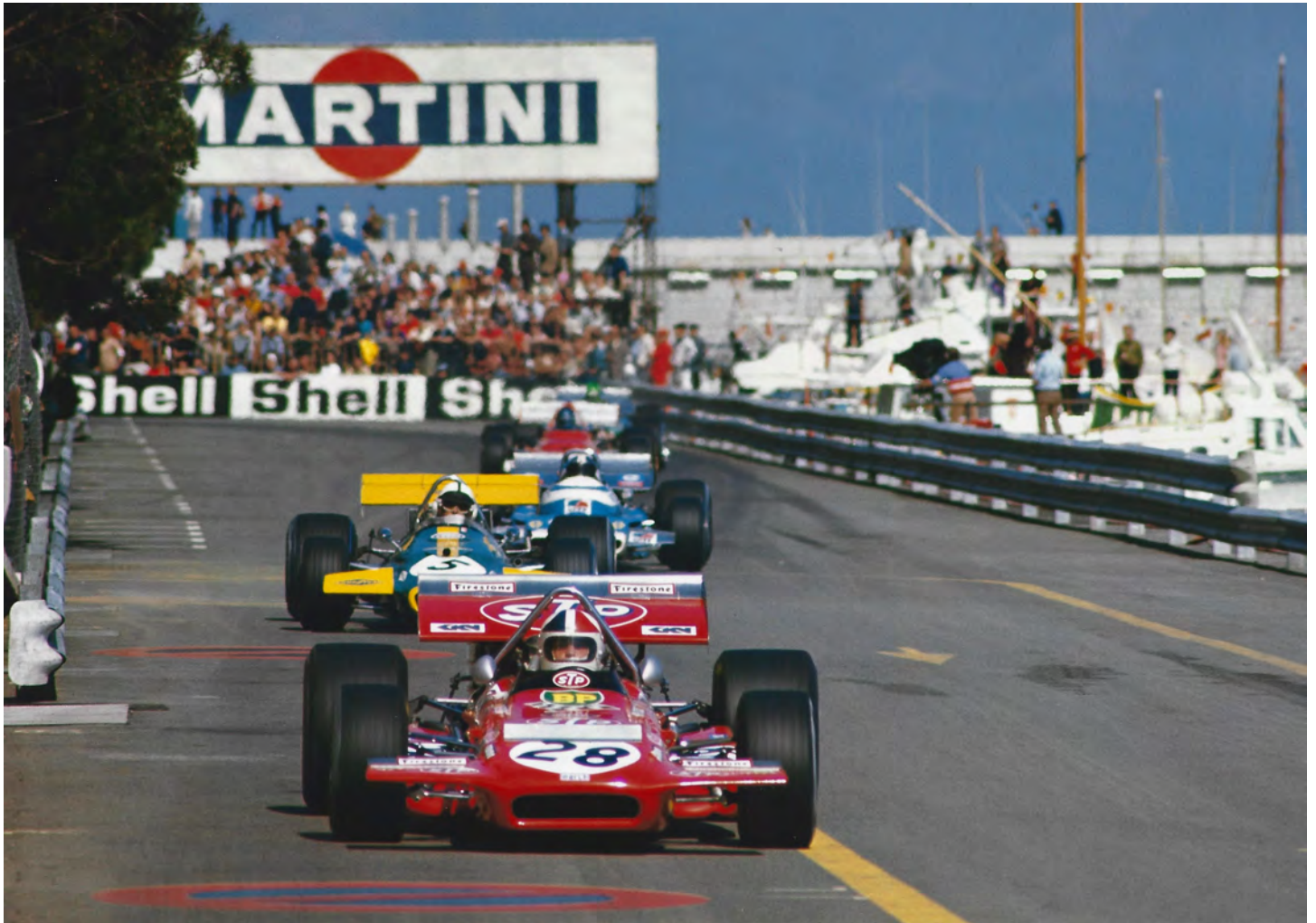
Year 1970 Make March Model 701 Chassis Number 701-1 Engine 3 Litre Ford-Cosworth DFV